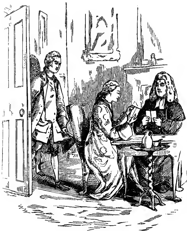
Preaching and Practice.